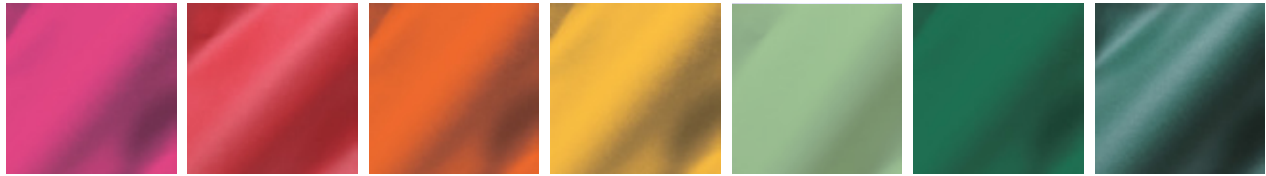
Fuschia 80# Cardinal 80# Tangerine 80# Melon 80# Kiwi 80# Emerald 80# Forest 80#