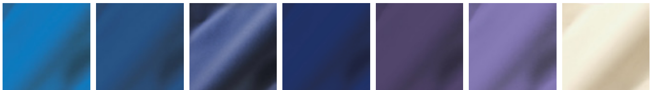
Cerulean 80# Lapis 80# Midnight 80# Presidential Blue 70# Deep Purple 80# Lavendar 80# Natural 80#