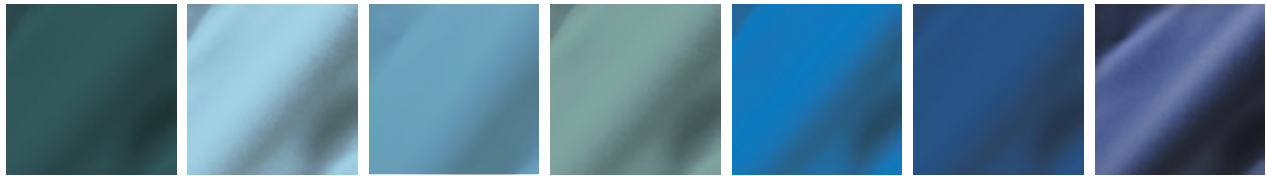
Spruce 80# Sky Blue 80# Turquoise 80# Teal 80# Cerulean 80# Lapis 80# Midnight 80#