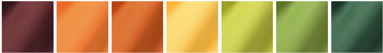
Burgundy 4590 Mandarin 4100 Burnt Orange 4101 Sunshine 4090 Pear 4121 Green Apple 4130 Juniper 4160