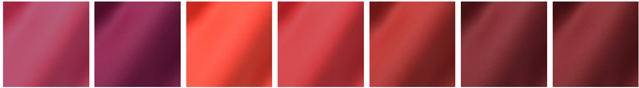
Fuchsia 4420 Cerise 4560 Flame 4440 Raspberry 4470 Red Delicious 4500 Cranberry 4580 Brick 4570