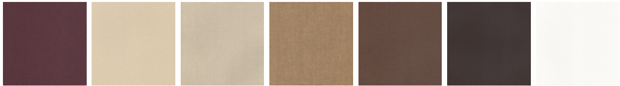
L-6425 Berry V-1520 Vanilla L-1005 Canvas L-3100 Wicker L-3150 Hickory V-3950 Coffee V-1500 Snow