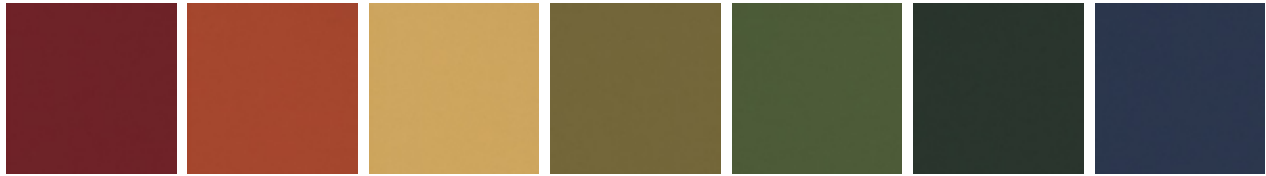
21109 Cardinal 21111 Orange 21101 Jonquil 21102 Campsite 21103 Meadow 21104 Pine 21106 Lapis