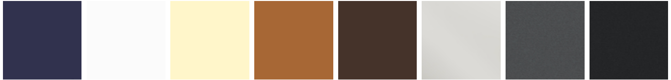
EM31 Indigo EM22 White EM24 Ivory EM32 Camel EM26 Espresso EM28 Silver EM07 Gray EM08 Black