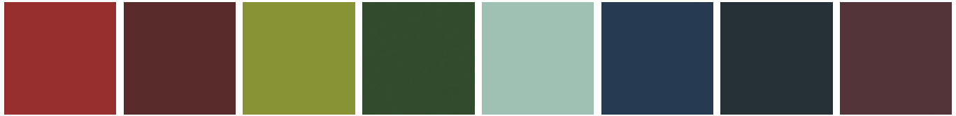
EM27 Ruby EM29 Burgundy EM25 Sage EM23 Tarragon EM15 Dover EM21 Tropic EM04 Navy EM18 Eggplant