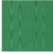
S50411 Hunter Green