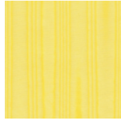
S50371 Ming Gold