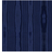
S50581 Admiral Blue