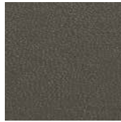
Dark Grey 8009